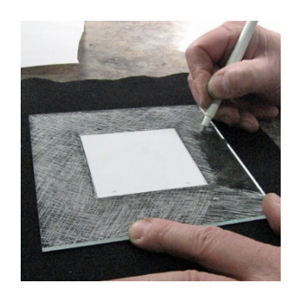
STEP 2 – OPTION 2 – DIAMOND ETCH THE GLASS

Rinse the glass well to remove all of the dust.