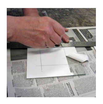
STEP 1 – MASK THE GLASS

Mirroring enhances the texture of glass. Before you mirror newly chipped glass, cover it with a wet cloth and let it sit overnight to soften any remaining spots of glue. Then scrub the glass well with a fingernail brush to remove the softened glue before mirroring. Small dots of glue left on the glass will be very visible after you mirror it.