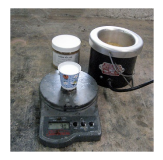
STEP 3 – MEASURE THE GLUE AND WATER

As with sandblasting, any areas that are not chipped off by the glue will be visible in the finished piece.