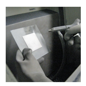
STEP 2 – OPTION 1 – SANDBLAST THE GLASS

Mask the areas you do not want to chip with adhesive vinyl. Our adhesive vinyl works well for light sandblasting.